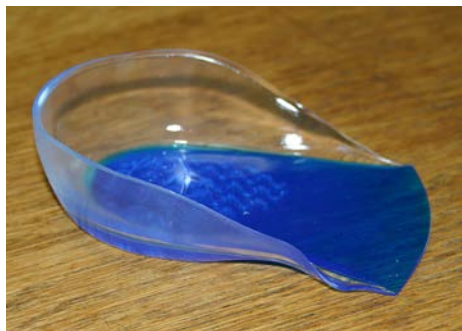
TuliGel heel cup

Examination of the area reveals local tenderness at the back of the heel, generally at the insertion of the tendo achilles. The tendo achilles is taut, so that dorsiflexion of the ankle is limited to a right angle or less. The patient will generally have pain when asked to walk on their heels and no pain when asked to walk on their toes. X-ray: usually normal.